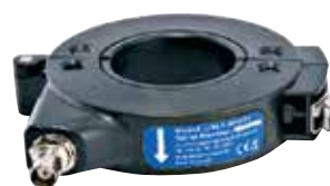
Radio Frequency Current Transformer (RFCT)