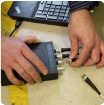
1. Plug In

The CableData Collector™ detects and quantifies PD activity in live distribution cables by measuring radio frequency currents, which are produced when discharges occur.