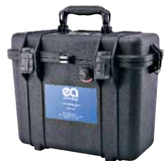
Rugged carry case