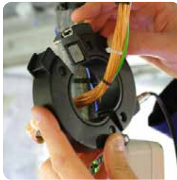
2. Clip On

The CableData Collector™ detects and quantifies PD activity in live distribution cables by measuring radio frequency currents, which are produced when discharges occur.